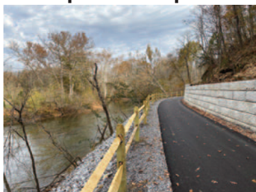
The Dick and Willie Trail