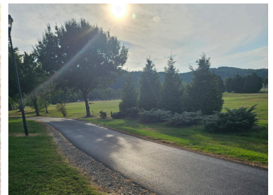
Jack Dalton Park