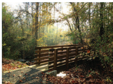
Lauren Mountain Preserve