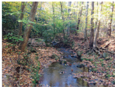
Doe Run Park